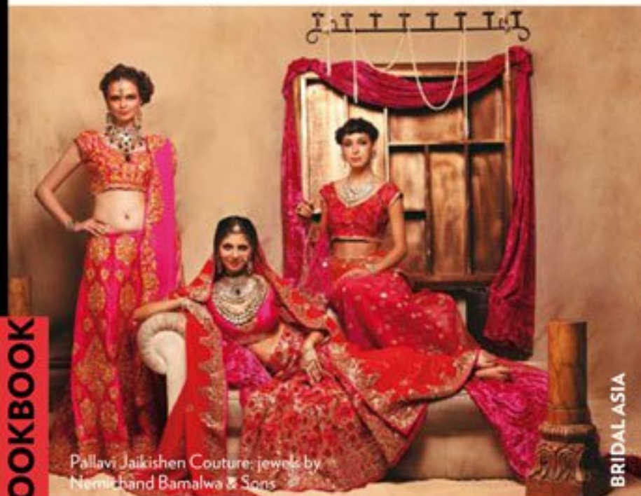
Pallavi Jaikishen Couture; jewels by Nemichand Barnalwa & Sons