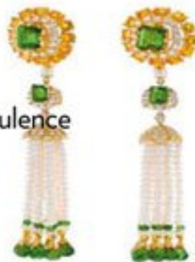
EARRINGS Nizam Collection, Ganjam (price on request)

Hark back to the old ages and surround yourself with opulence