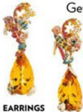
EARRINGS Dior Fine Jewellery (price on request)

Get swept away by the unfettered appeal of the aquatic life