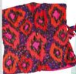
CORSET AND DRESS Nachiket Barve (price on request). Cue at Aza (₹ 13,500)

Incorporate elements of the sea into your table settings by arranging a bunch of shells casually. You can also get creative with pieces of glass and use them in candlestands. Cutlery, Rosenthal; table setting by Marry Me Weddings