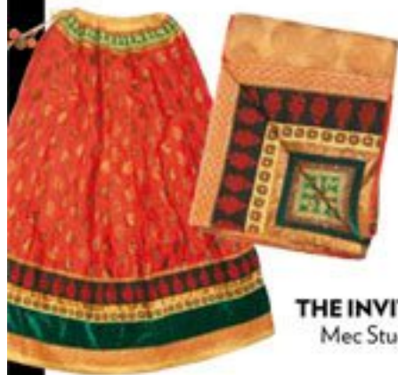
LEHENGA & DUPATTA SET Melange (price on request)

Opt for an intimate setup with a royal sit-down dinner. Go for the deepest shade of maroon and other jewel tones. Cutlery and crockery, Versace at Rosenthal; Cake, Le 15 Patisserie; table setting by Marry Me Weddings