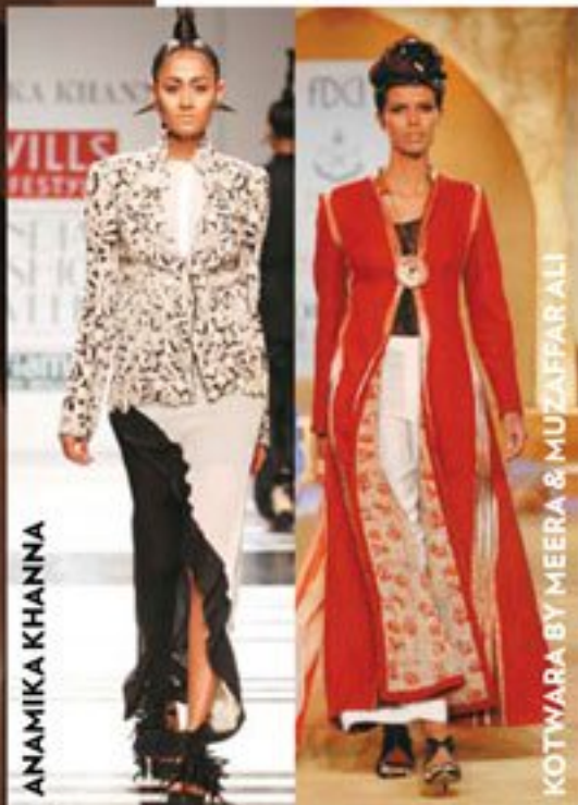
KOTWARA BY MEERA & MUZAFFAR ALI