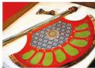
THE INVITE Mec Studio