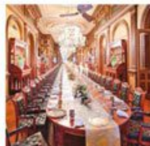
THE LOCATION TAJ FALAKNUMA PALACE, HYDERABAD, HAS OUR VOTE FOR ITS OLD WORLD CHARM

If anything to do with royalty makes you weak-kneed, recreate the Nizam era to look your luxe best. Jewellery in its truly regal form is essential to making this day memorable. Choose between more conventional versions of the classic lehenga or go all out and invest in the most voluminous options in rich velvets and heavy thread work.