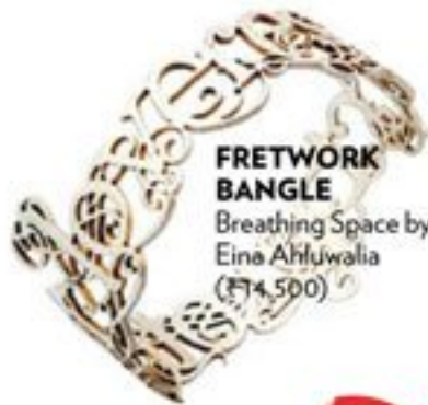
FRETWORK BANGLE Breathing Space by Eina Ahluwalia (₹4,500)